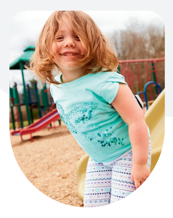
2019 Pump Market Pirmer Final Seagrove

Ranked most durable insulin delivery system over traditional pumps