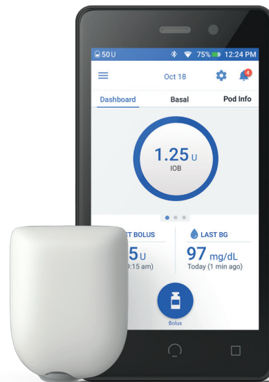
Pod shown without the necessary adhesive.

¶ Upgrades subject to user's insurance coverage. Subject to co-pays as required by insurance coverage.