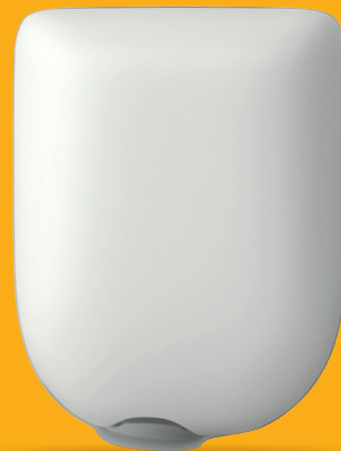
Pod shown without the necessary adhesive.

Omnipod 5 System is the first tubeless automated insulin delivery system that integrates with the Dexcom G6 continuous glucose monitor. A brand new duo. Designed to deliver.