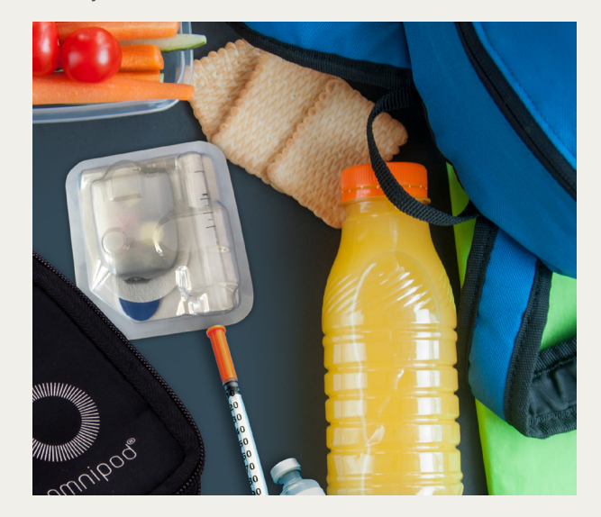
Refer to the Omnipod DASH<sup>®</sup> System Podder<sup>™</sup> Resource Guide for complete safety information including indications, contraindications, warnings, cautions and instructions.